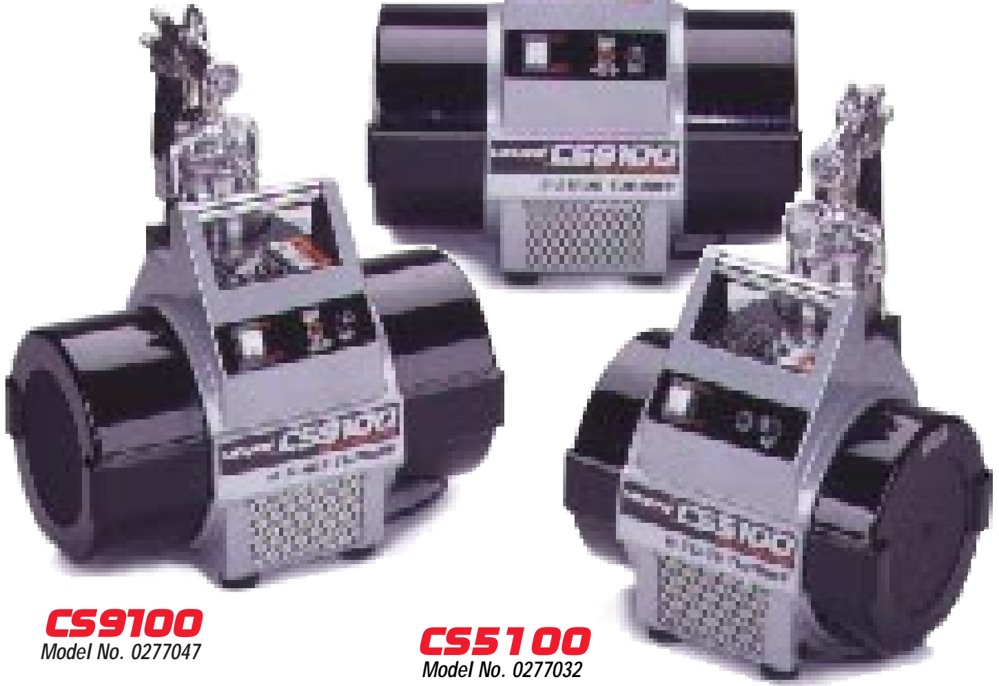
CS8100 Model No. 0277030