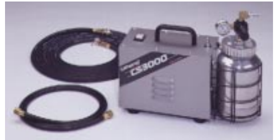
Standard HVLP Maintenance Kit