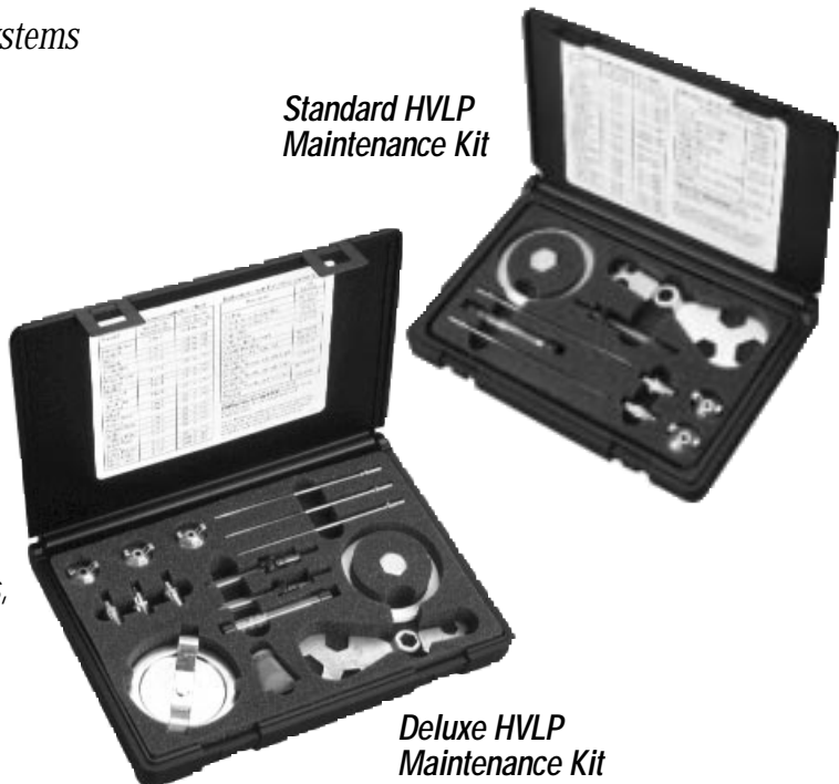
Deluxe HVLP Maintenance Kit