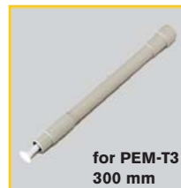
for PEM-T3 300 mm 300 mm