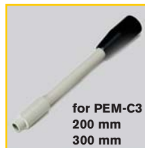
for PEM-C3 200 mm 300 mm