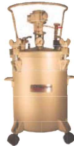
10 GALLON TANK WITH AIR POWERED AGITATION 51-553 SINGLE REGULATED 51-554 DOUBLE REGULATED