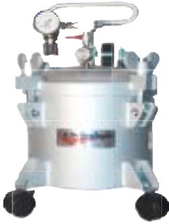
2.5 GALLON PRESSURE TANK TEFLON COATED 51-201 SINGLE REGULATED 51-202 DOUBLE REGULATED