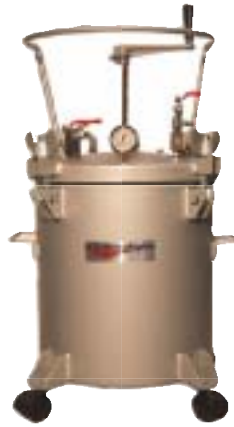
5 GALLON TANK WITH MANUAL AGITATION 51-501 SINGLE REGULATED 51-502 DOUBLE REGULATED