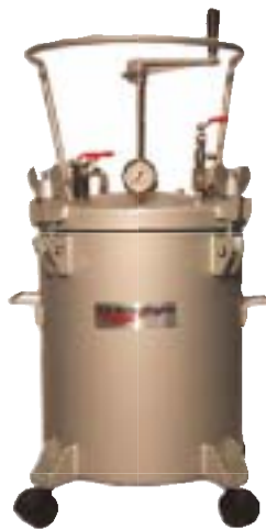
10 GALLON TANK WITH MANUAL AGITATION 51-557 SINGLE REGULATED 51-558 DOUBLE REGULATED