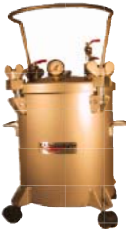
10 GALLON TANK WITH NO AGITATION 51-551 SINGLE REGULATED 51-552 DOUBLE REGULATED