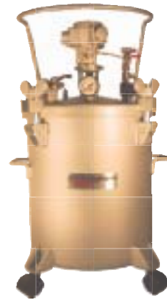
5 GALLON TANK WITH AIR POWERED AGITATION 51-503 SINGLE REGULATED 51-504 DOUBLE REGULATED