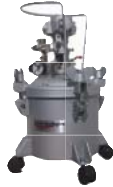
2.5 GALLON PRESSURE WITH AIR POWERED AGITATION 51-203 SINGLE REGULATED 51-204 DOUBLE REGULATED