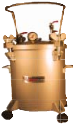
5 GALLON TANK WITH NO AGITATION 51-507 SINGLE REGULATED 51-508 DOUBLE REGULATED